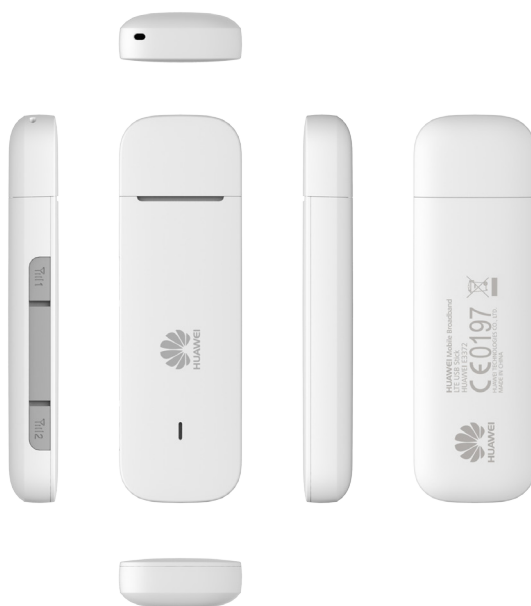
Figure 1-1 E3372 profile

Figure 1-1 shows the profile of the E3372.